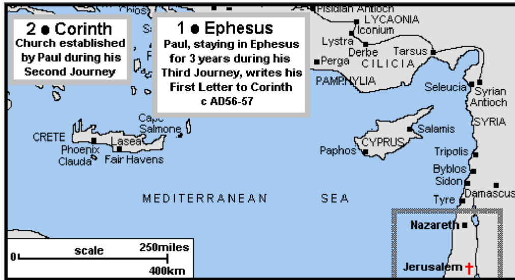
Map 5. Shows the location of Tyre and Sidon

And immediately an angel of the Lord struck him because he did not give God the glory, and he was eaten by worms and died.