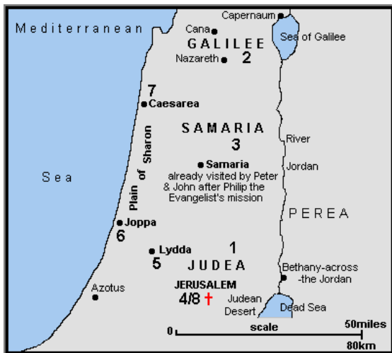
Map 3. Shows the location of Judea, Caesarea and Galilee

Now when day came, there was no small disturbance among the soldiers as to what could have become of Peter. When Herod had searched for him and had not found him, he examined the guards and ordered that they be led away to execution. Then he went down from Judea to Caesarea and was spending time there.