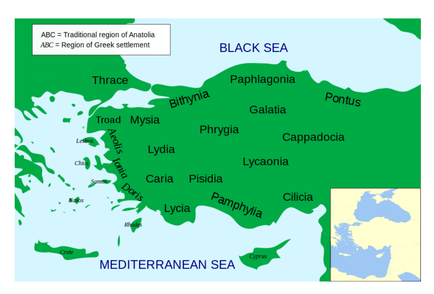
Map 7: Location of Lycaonia in Anatolia (comprising the majority of nowadays Turkey)

But when the apostles Barnabas and Paul heard of it, they tore their robes and rushed out into the crowd, crying out and saying, "Men, why are you doing these things?"