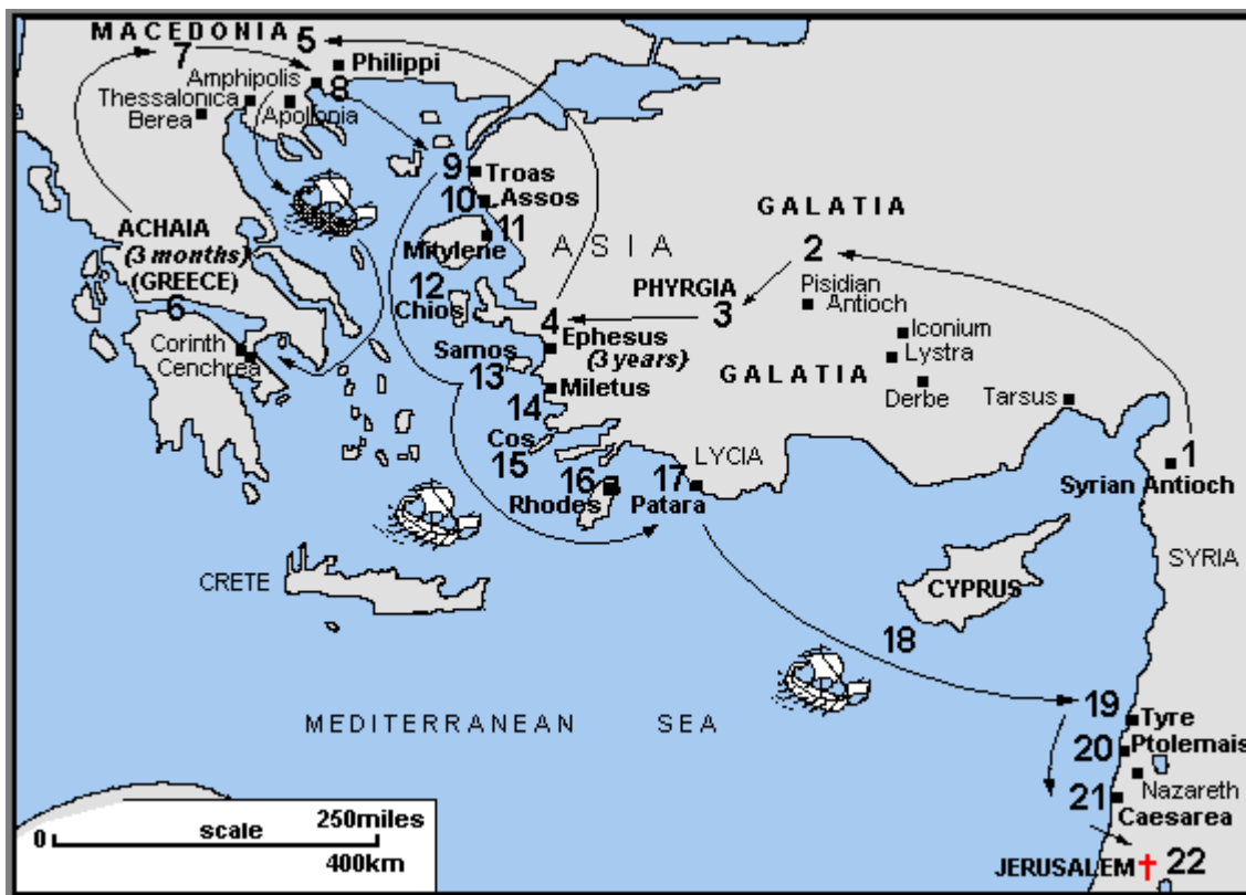
Map 10. Shows the location of Macedonia, Greece, Syria, Berea, Derbe, Asia, Troas and Philippi

After the uproar had ceased, Paul sent for the disciples, and when he had exhorted them and taken his leave of them, he left to go to Macedonia. When he had gone through those districts and had given them much exhortation, he came to Greece. And there he spent three months, and when a plot was formed against him by the Jews as he was about to set sail for Syria, he decided to return through Macedonia. And he was accompanied by Sopater of Berea, the son of Pyrrhus, and by Aristarchus and Secundus of the Thessalonians, and Gaius of Derbe, and Timothy, and Tychicus and Trophimus of Asia. But these had gone on ahead and were waiting for us at Troas. We sailed from Philippi after the days of Unleavened Bread, and came to them at Troas within five days; and there we stayed seven days.