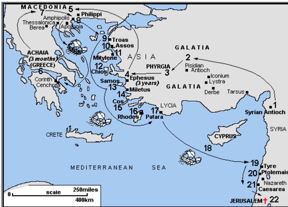
Map 10. Shows the location of Troas, Assos, Mitylene, Chios, Samos, Miletus, Ephesus and Jerusalem

Paul well knew that he could not appear on the scene among so many converts, friends and co-workers without being detained for a considerable length of time. He would therefore disembark instead at Miletus, and from there summon only the elders of the church for a farewell message of encouragement and exhortation.