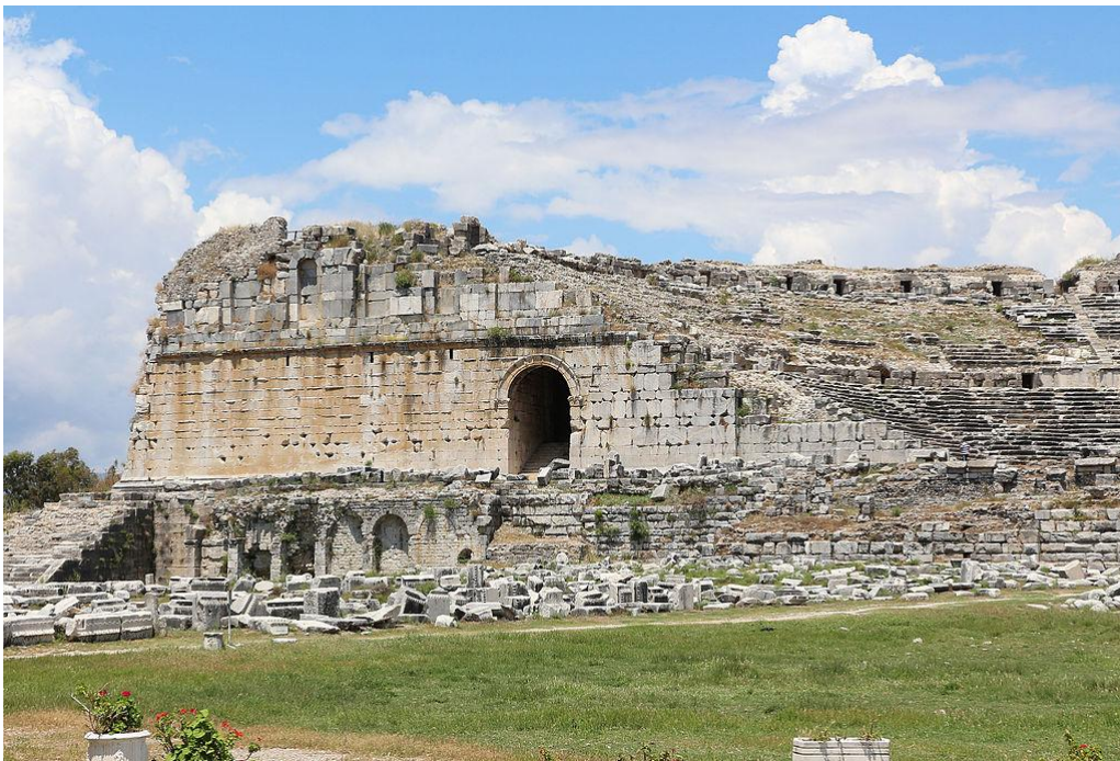
Photo 36 Ancient Greek theatre in Miletus

It must be remembered that “the kingdom” is a very broad one. We find it used in both the opening and closing verses of the Acts and in each case the context must be kept in view.